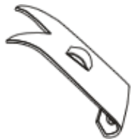
Earthwings Model # 2C

For trees up to 2" in caliper, holding power approximately 250 lbs.